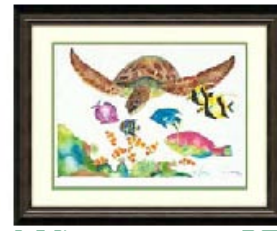
Something Fishee 12" x 16"