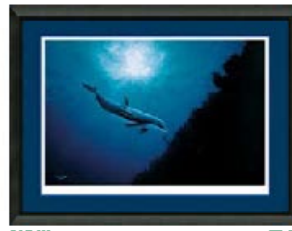
Dolphin Vision 12" x 16"