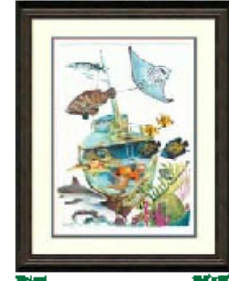
Wy Land 12.5" x 16"