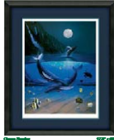
Ocean Passion 12.5" x 16"

Offer details: Offer valid on Wyland fine art purchases of $700 or more. Wyland custom designed framing and shipping extra. Plus, save 50% on the suggested frame retail price of $500 — just $250!