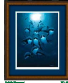
Dolphin Playground 12" x 16"